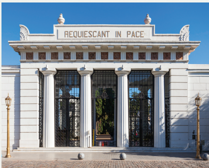
LA RECOLETA CEMETRY